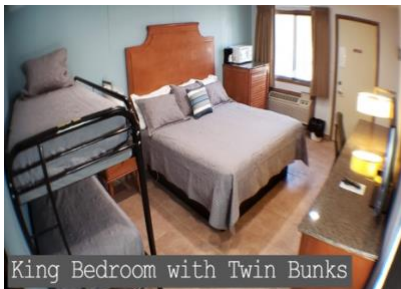
King Bedroom with Twin Bunks

Two restaurants within walking distance.