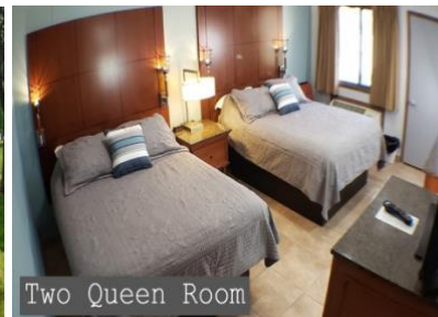
Two Queen Room

Hotel website: https://lewisandclarkpark.sd.gov/cabin-motel-lodge-information.aspx